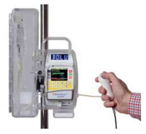
Lockbox for drug securement, drug protocols and ergonomic bolus cable for safe pain control

MediGuard<sup>™</sup> is a specialised software solution to adapt drug limits based on patient weight, particularly useful in treatment of frail and paediatric patients.