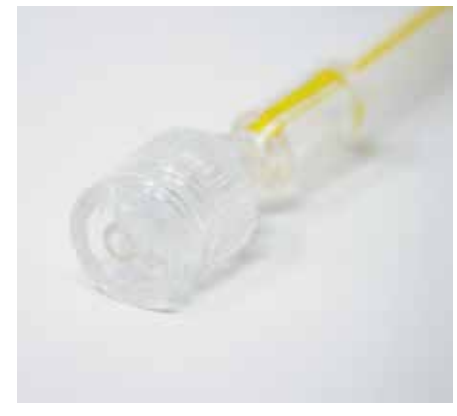
Sets with NRFit<sup>™</sup> connections available for improved patient safety

Your practitioners can have the utmost confidence in BD's pumps and solutions – enabling them to deliver clinical procedures wherever care is provided.