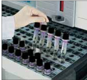
Step 3. Remove the set once completed