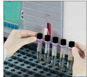
Step 2. Scan the set into the instrument