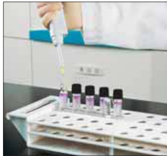
Step 1. Inoculate the SIRE set

† Antimycobacterial Susceptibility Test. *For isoniazid and streptomycin.