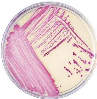
BBL CHROMagar MRSA II