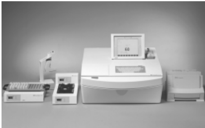
Figure 1: BDProbeTec ET System