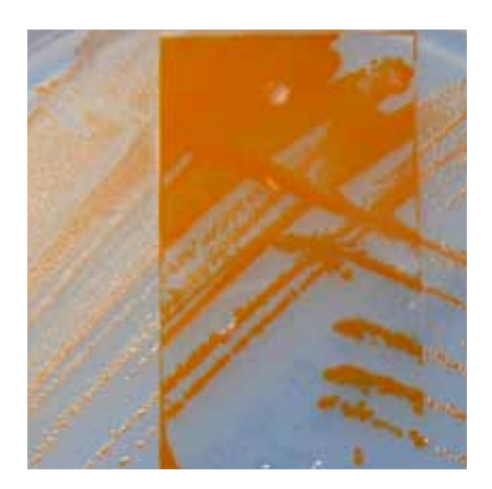
BD<sup>™</sup>Group B Streptococcus Differential Agar (Granada Medium) cat. no. 257079 Intensification of orange pigment of S. agalactiae under a cover slide incubated in a CO_2 enriched aerobic atmosphere

Incubation of BD Group B Streptococcus Differential Agar (Granada Medium) in an aerobic atmosphere enriched with carbon dioxide results in weaker formation of the orange pigment and, possibly, in the loss of weak pigment producers and is therefore not recommended. Additionally, colonies of many strains are larger when incubated anaerobically. Therefore, the anaerobic incubation significantly improves the detection of orange colonies.