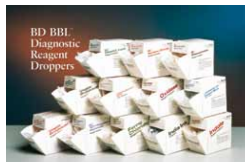
BBL™ Diagnostic Reagent Droppers feature reagents hermetically sealed in an ampule to protect from chemical instability. The droppers provide shelf-life ranging from one to three years, with no refrigeration.

Eighteen varieties of diagnostic droppers are available to offer the microbiologist a solution to the problem of perishable identification reagents and stains. Featuring reagents hermetically sealed in an ampule to protect from chemical instability, the droppers provide shelf-life ranging from one to three years, with no refrigeration. Since the droppers are ready to use, there is no mixing or measuring. Each also contains a one-day supply of reagent or stain, thus reducing the waste and inconvenience associated with bulk reagents. BBL™ Diagnostic Reagent Droppers include Oxidase Reagent, Indole Reagent, DMACA Indole Reagent, Ferric Chloride Reagent, PYR Reagent, Ninhydrin Reagent, Nitrate A and B Reagents, Voges-Proskauer A and B Reagents, Desoxycholate Reagent, 10% Potassium Hydroxide Reagent, Acridine Orange Reagent, Dobell and O'Connor's Iodine Stain, Lactophenol Cotton Blue Stain, India Ink, Calcofluor White and Evans Blue Droppers. To perform the tests, simply hold the dropper upright and squeeze to crush the ampule inside. Next, invert the dropper for convenient drop-by-drop dispensing of solution.