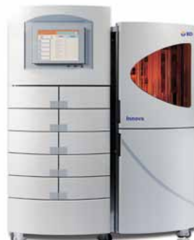
BD™ Innova Automated Microbiology Specimen Processor

The Innova is ideal for a high volume laboratory due to its large capacity and long walk-away time but also suitable for small to medium volume laboratories due to its versatility in processing a wide variety of specimen types and specimen containers at once with minimal intervention required.