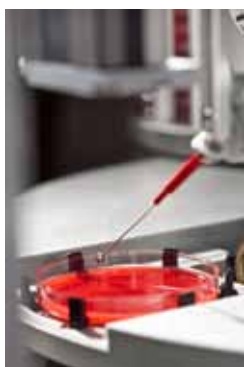
Streaking samples on agar plates