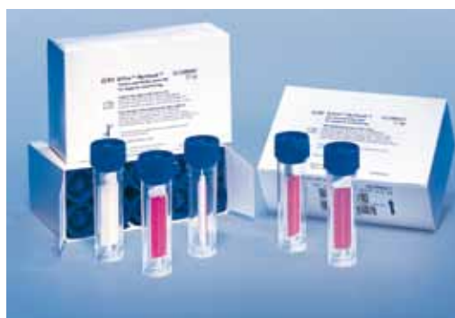
BD Hycheck™ Hygiene Contact Paddles, for monitoring surfaces and liquids.

Monitoring industrial fluids (cooling tower water, machine tool coolants and paper slurry) for bacteria is done to prevent the fluids from causing a variety of ill effects including equipment damage, contact dermatitis, unpleasant odor, clogged nozzles and filters, and contaminated/damaged product.