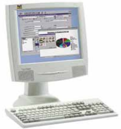
BD EpiCenter™ Data Management System

... resulting in enhanced data handling and trend analysis. Graphics and tables can be displayed by simply pushing a button.