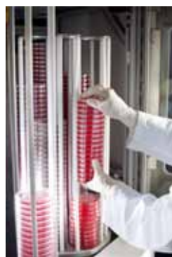
Removing inoculated plates