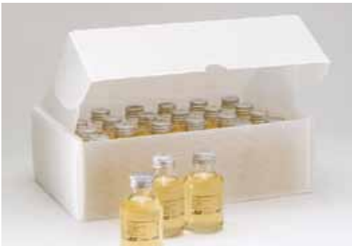
EtO gassed multipacked sterility testing bottles in polypropylene box.

Bottles are wrapped in a polypropylene box, 2 Stericlin® bags and an outer transport box.