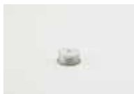
Screw cap with hole