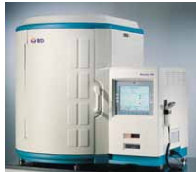
The BD Phoenix™ 100 instrument is easy-to-use and can perform up to 100 tests simultaneously.

The BD Phoenix™ Automated Microbiology System combines world class automation with state-of-the-art microbiology to deliver rapid, accurate identification of clinically relevant bacteria. Phoenix™ panels are currently available for identification of gram-positive and gram-negative bacteria. Phoenix™ panels are stored at room temperature and have one year shelf life.