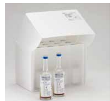
BD BACTEC™ FX media bottles in EtO gassed, double wrapped, plastic box.