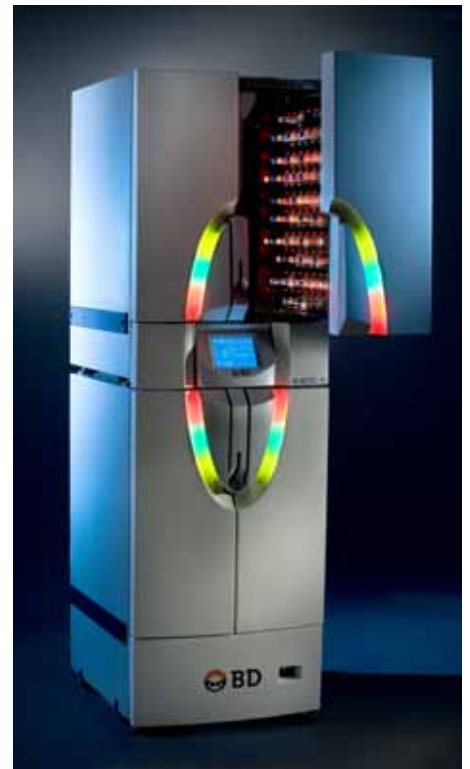
BD BACTEC™ FX Instrument Stack consisting of 1 top and 1 bottom unit