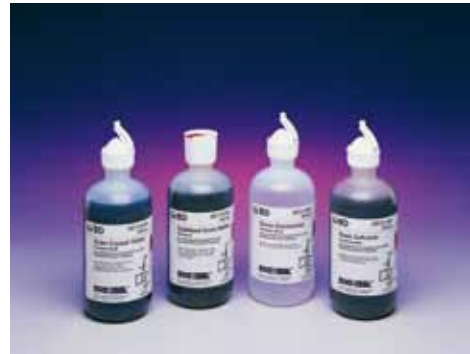
The 4-Step Gram Stain Kit, available with stabilized/unstabilized iodine.

Available with Stabilized/Unstabilized Iodine.