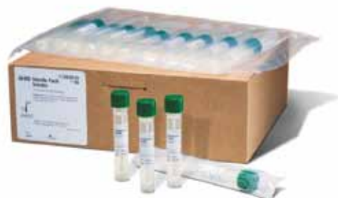
BD Sterile Pack Swabs for Environmental Monitoring.

The ATP-free Dacon™ swab has a one year shelf-life at room temperature storage.