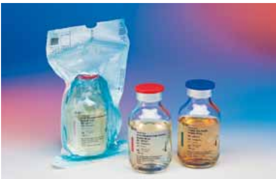
Fluid Thioglycollate Medium, Sterile Pack Double-Wrap, and Tryptic Soy Broth, Sterile Pack Double-Wrap

BD Sterile Pack Sterility Testing Bottles are terminally sterilized inside autoclavable double-bags. This unique manufacturing process results in a bottle exterior that is free from microbial contaminants.