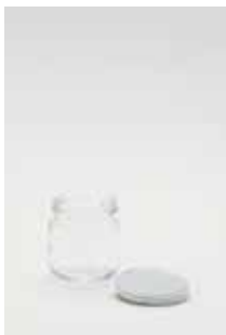
Wide mouth jar