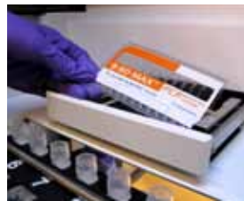
Microfluidic PCR cartridge