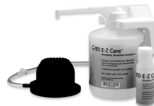
BD E-Z Care Rinseless, Brushless Antiseptic