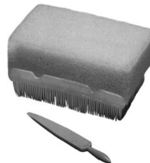
BD E-Z Scrub Preoperative Scrub Brush