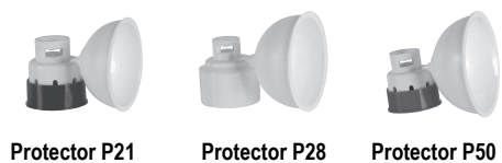
Protector P21 Protector P28 Protector P50