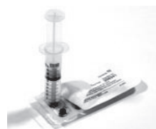
Luer Tip Cap, Tray