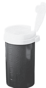
BD Tamper-Tuf Oral Medication Container