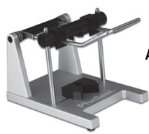
Assembly Fixture M12