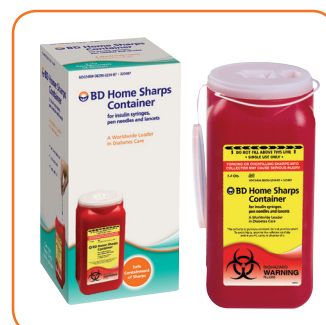
BD™ Home Sharps Container