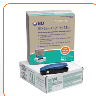
BD Safe-Clip™ by Mail