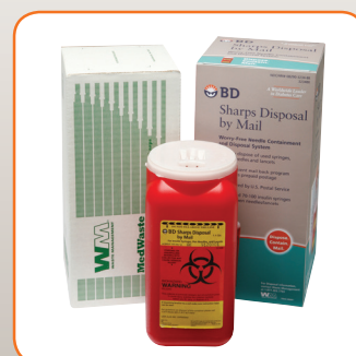
BD™ Sharps Disposal by Mail