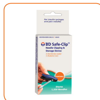
BD Safe-Clip™ Device