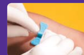
Needle retracts from the vein and locks into place, offering immediate protection against needlestick injury

View the BD Vacutainer® Push Button Blood Collection Set in action and learn more about this innovative advance in safety and satisfaction: www.bd.com/vacutainer/producttraining