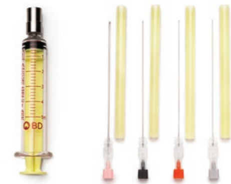
NRFit spinal needles and syringes