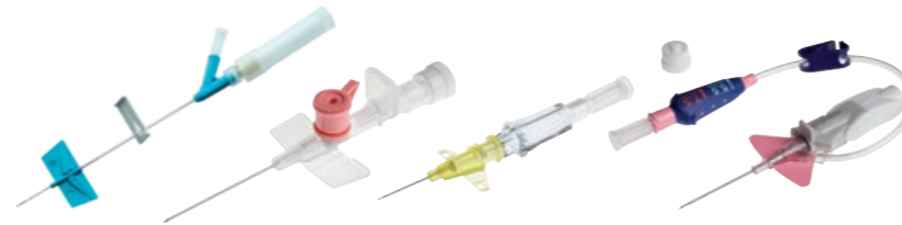
Peripheral catheters for IV and subcutaneous infusion