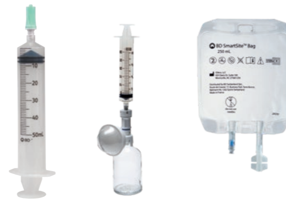
Hazardous medical products safe handling solutions