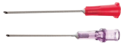
Blunt filter needles