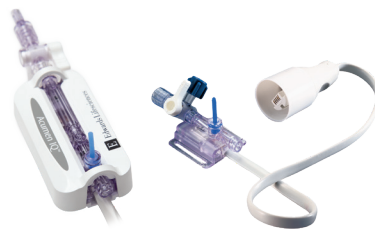
Any BD invasive arterial transducer