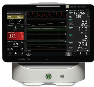
Only available on HemoSphere Alta™ Monitor