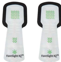
ForeSight IQ™ Sensor(s) (FSES LIQ) Cerebral location on adults only