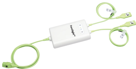
ForeSight™ Oximeter Cable (HEMFSM10)