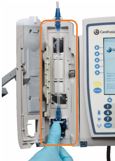
Figure 1a: Pump Module with door open showing the front of the bezel