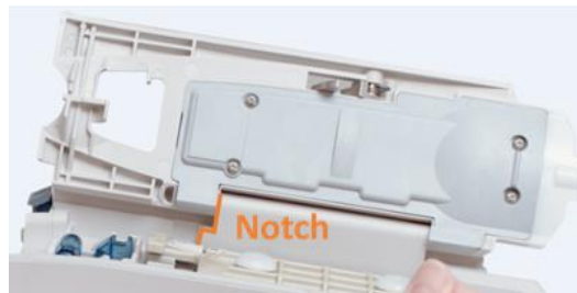
Figure 4: Side view of non-affected bezel, Valox