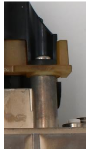
Figure 2b: Bezel post with NO separation