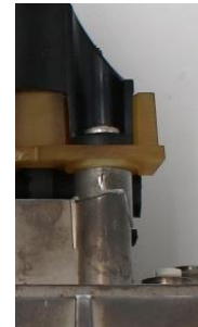
Figure 2c: Bezel post WITH separation