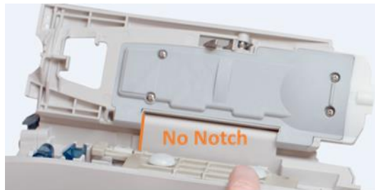
Figure 3: Side view of affected bezel, FR-110