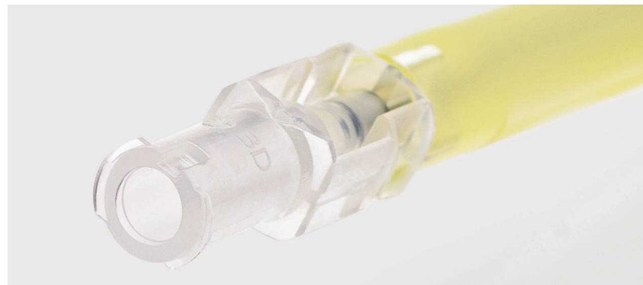
A magnification of the BD® Quincke Spinal NRFit™ Needle Hub