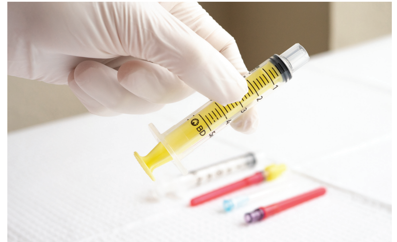
BD® 5 mL Plastic Syringe NRFit™ Slip (in hand)

For over 100 years, BD has built its legacy on performance and trust through the delivery of high-quality products, service and support—resulting in a portfolio of hypodermic needles and syringes that is more widely used by healthcare professionals globally than any other brand.