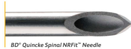
BD® Quincke Spinal NRFit™ Needle

Featuring a stylet and cannula hub key/slot arrangement that facilitates proper needle bevel orientation, BD® Quincke Spinal NRFit™ Needles are available in 22 sizes with lengths ranging from 76.2 mm to 177.8 mm and gauges from 18 G to 27 G.