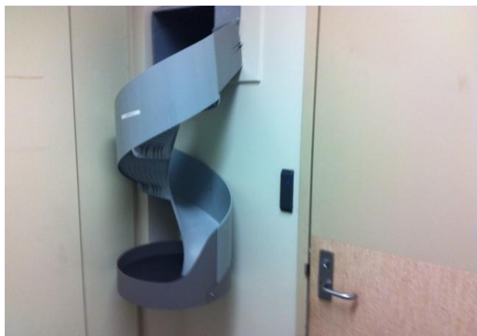
Remote pharmacist after hours stock release