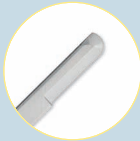
Standard Width Blade Catalog #376400